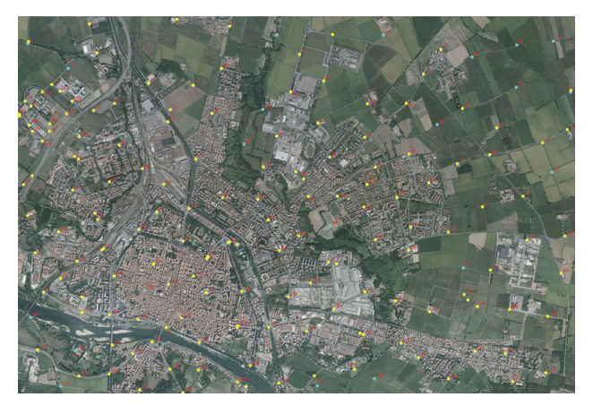
Figure 1. Distribution of the AGCPs over the test site

Finally there are many ground control and check points. There are around 180 artificial ones (AGCP) which are white squares of 35 cm. They homogeneously cover the whole test site, which is 6 x 4.5 km wide.